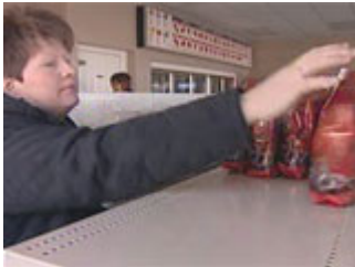
Stocking the shelves at Kolos Grocery in Morden