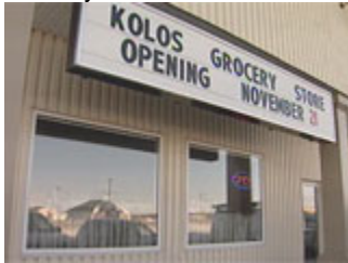
Kolos Grocery store is set to open its doors Nov. 21, 2008